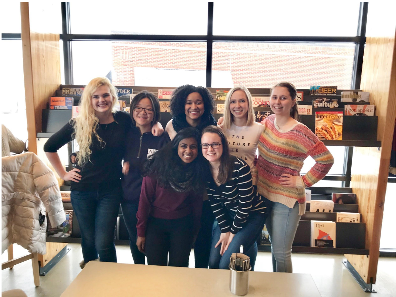
Executive Board 17-18

The College of Engineering recognized ACM-W for its impactful and innovative outreach initiatives for K-12 students.